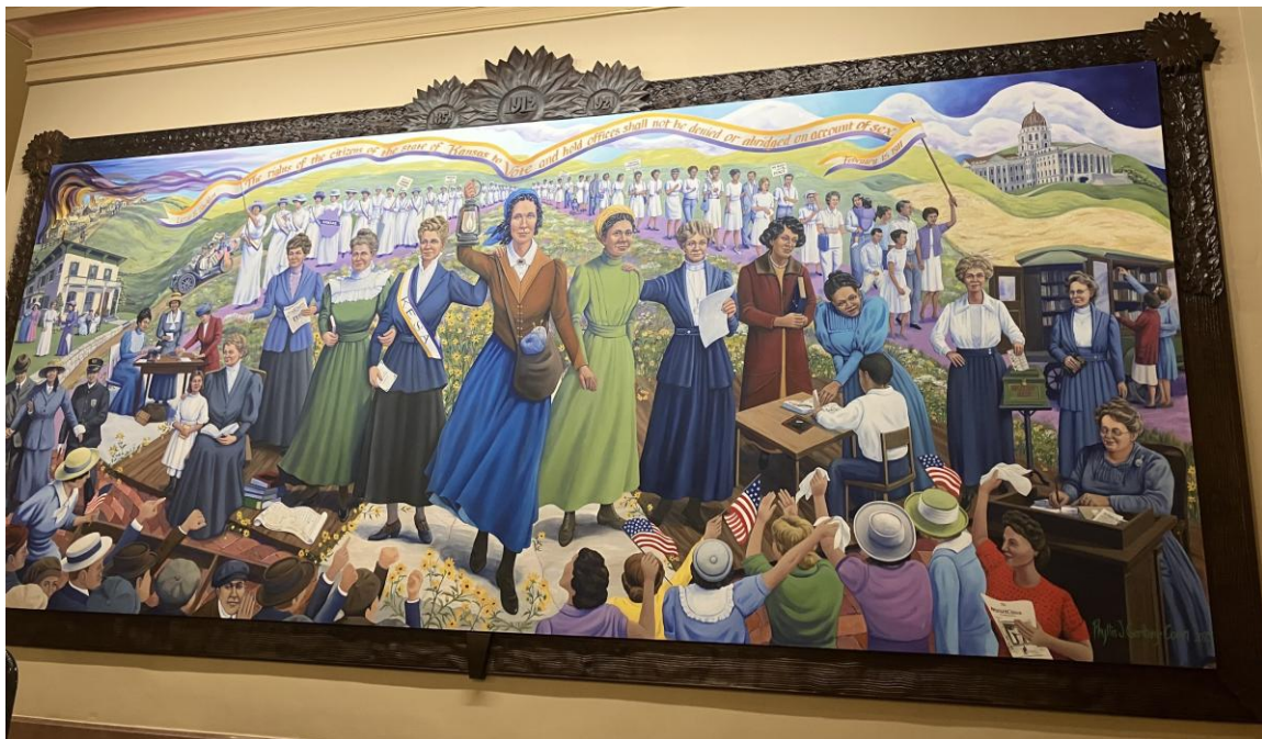
Final framed painting of Rebel Women .