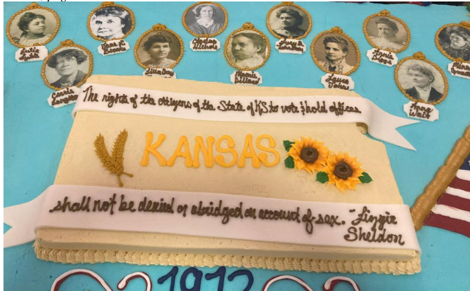
Cake celebrating the KS Suffragist Memorial.