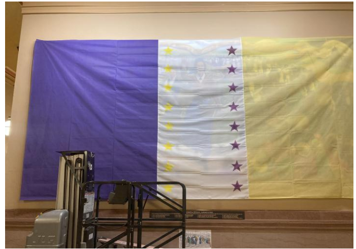
Here's the mural covered with the flag representing Women's Right to Vote.